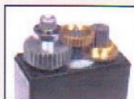
Composite metal gears consisting of a hard anodized output gear and hardened steel and brass counter gears give a virtually unstrippable backlash-free gear train.