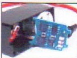
JR's new digital amplifier features a high-frequency 300 Hz output and high power FET transistors for the ultimate in response and holding torque.

Comparable to the 4131, the DS8231 brings owners the enhanced precision, resolution and holding torque only a digital servo can provide. Nylon gears.